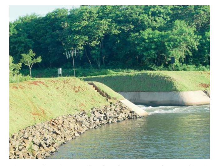
Fig. 3. Radio-telemetry fixed station at "Lago das Grevilhas", in the lateral channel near Itaipu Dam.