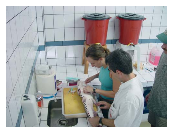
Fig. 2. Surgical implantation of a radiotransmitter in Pseudo-platystoma fasciatum , captured in the lateral channel located near Itaipu Dam.

The data stored by the automatic Lotek stations were downloaded a minimum of two times per week, and more of-