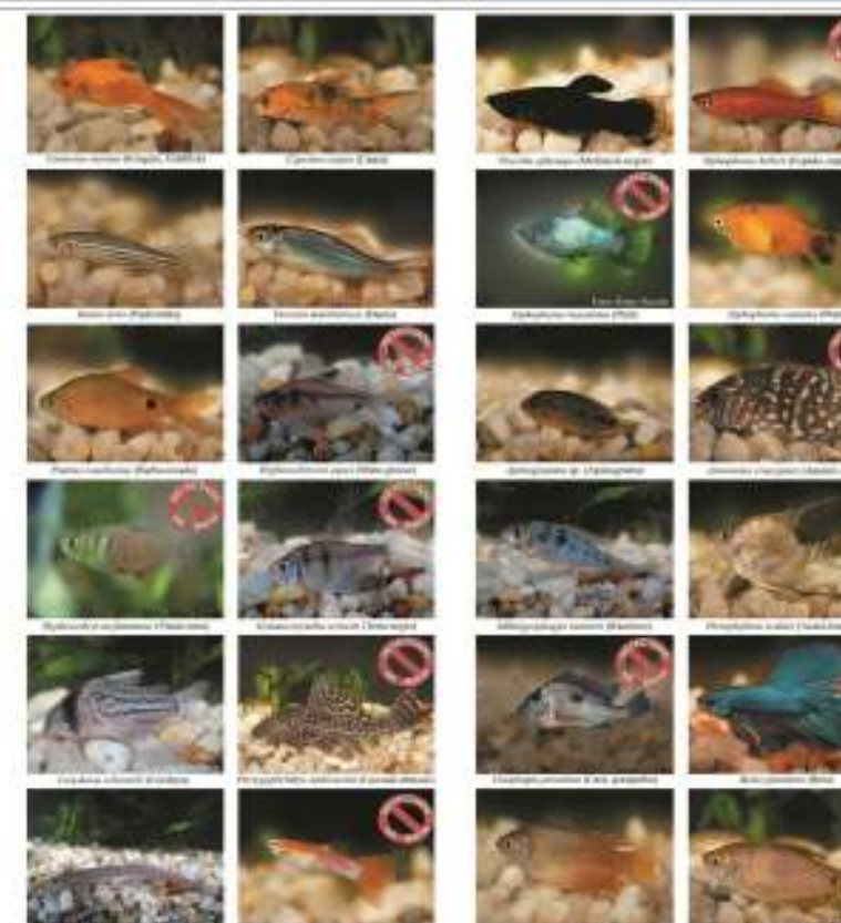
Fig. 2 - Example folder with information on species of non-native ornamental fish, in order to instruct aquarist and society in general. Folder reproduced of Garcia et al. (2014).