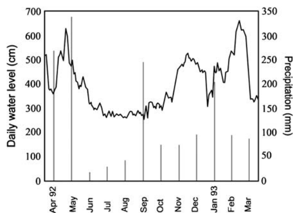
Fig. 1 Daily variation in the hydrometric level (cm; line) of the Paraná River, and monthly average precipitation (mm; bars) during the study period (April 1992 to February 1993)

The present study was conducted in the area of the Upper Paraná River floodplain (in Brazil), located in the Paraná River Basin, the second largest basin of South America. This floodplain comprises the last free-flowing (undammed) stretch of the Upper Paraná River within the Brazilian territory, and lies between the mouths of the Paranapanema and Ivinheima rivers (22° 45'S; 53° 30'W). Its pluvial regime is marked by a wet season from October to February, when the average rainfall is greater than 125 mm monthly (Fig. 1). The flooding period extends from 2 to 4 months, usually between November and May. The dry season occurs from June to September, characterized by an average rainfall less than 80 mm monthly (Fig. 1). Among the seasons, the average variation in